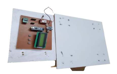
Fig. 3 Front view of the Project