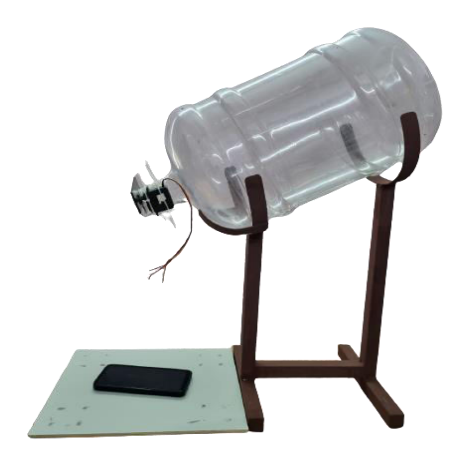
Fig. 2 Front view of the Project