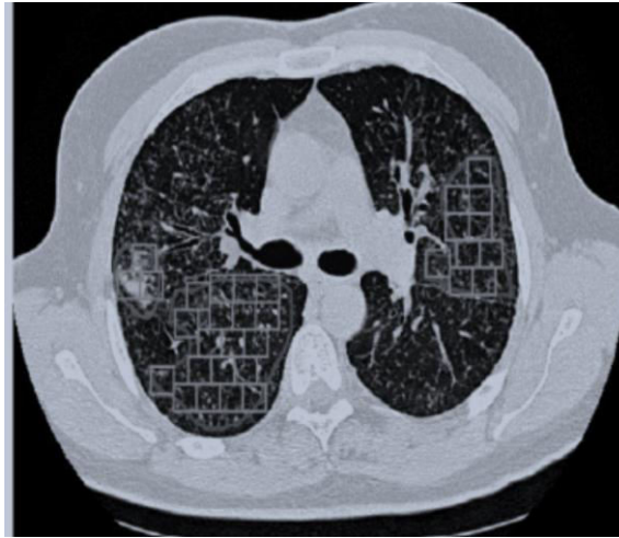
Figure 3: Example of generating image patches through the annotations of a CT slice

Artificial Intelligence (AI) is utilized to work on the precision of the diagnosis of lung sicknesses. Machine learning uses algorithms that can gain from and perform prescient data analysis. A deep learning algorithm for recognizing Cardiovascular Sicknesses. A 12-layer convolutional neural network to separate BAC (Bosom blood vessel calcifications) from non-BAC and apply a pixel-wise fix-based methodology framework exhibition is evaluated utilizing both free-reaction recipient working trademark (FROC) analysis and calcium mass measurement analysis[8].