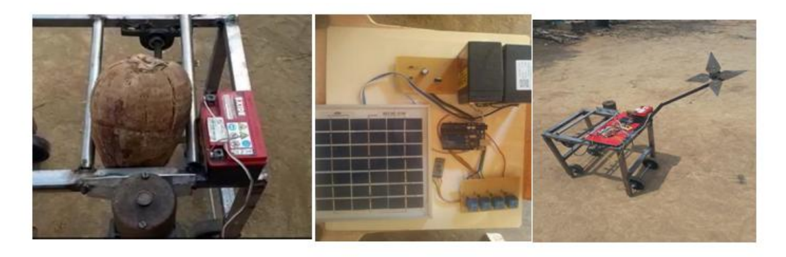
Figure.1 Final Output

This machine is mainly design to harvest the coconut and to cut coconut with the help of various tools like cutting blade, hole making tool. The important thing about this machine is that it reduces the time of cutting the coconut, along with the coconut the various fruits can be cut out on these machines. The two operations can be done simultaneously there is no any extra attachment is required for performing the operations. The cost of the developed machine is very less so that it can be used in small restaurants and shops. This will definitely improve the productivity of coconut in all parts of the country and various new applications can be generated in future.