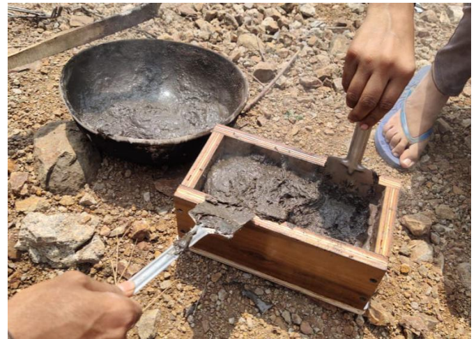
Fig. 2.Preparation of bricks in mold